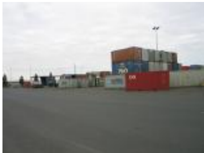
Container yard – No controls.